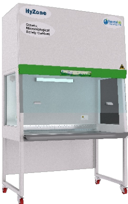
Microbiological Safety Cabinet & Laminar Air Flow