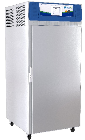
Deep Freezer (-20°C, -40°C, -60°C, -86°C)