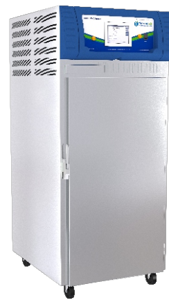
Cooling Cabinet (2°C To 8°C)