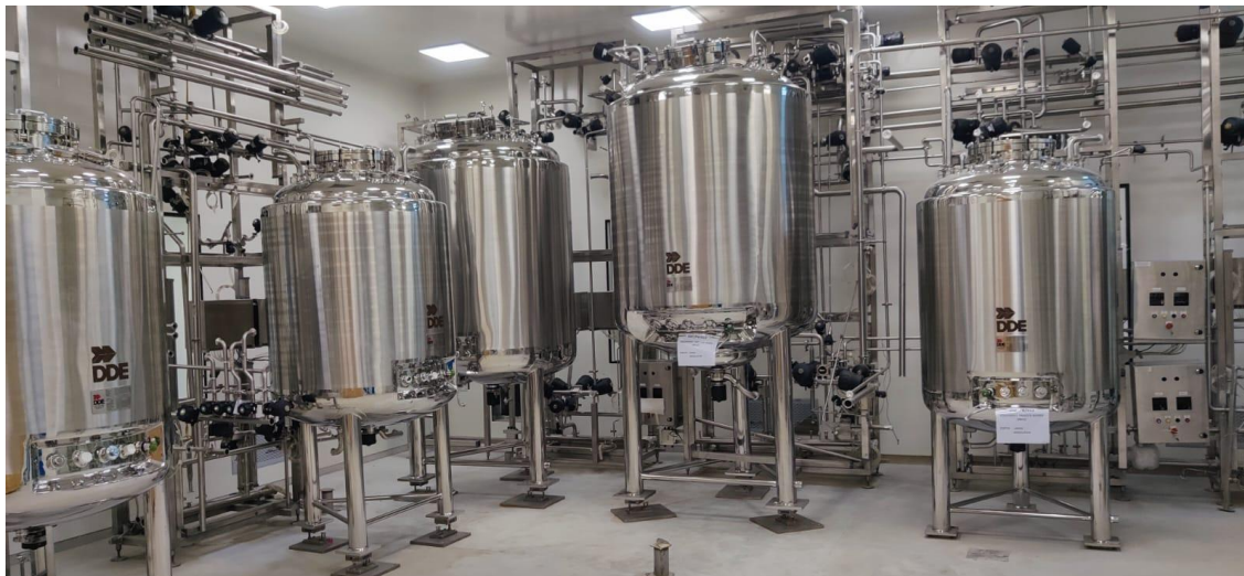
Process Area SF -2