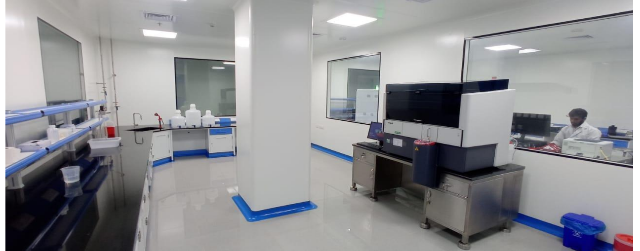
Plasma Testing Lab