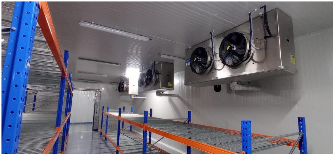
FG Warehouse Cold Room