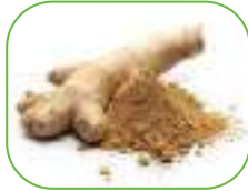
SPRAY DRIED POWDER