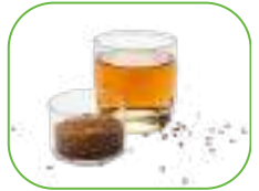
GREEN SOLVENT EXTRACTS