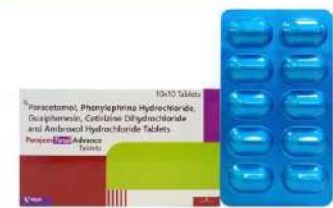
Paracetamol 325mg + Phenylephrine HCl 5mg + Guaiphenesin 50mg + Cetirizine HCl 5mg + Ambroxol HCl 15mg