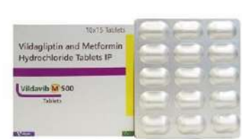
Vildagliptin 50mg + Metformin 500mg