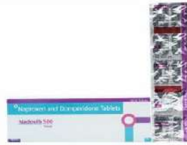
Naproxen 500mg +Domperidone 10mg