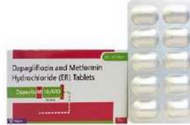
Dapagliflozin 10mg + Metformin (ER) 500mg