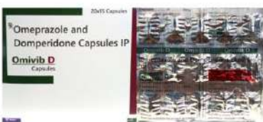
Omeprazole 20mg + Domperidone 10mg