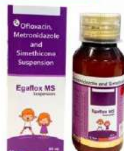
Ofloxacin 50mg + Metronidazole 120mg + Simethicone 10mg Suspension