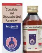
Sucralfate 1000mg + Oxetacaine 20mg Suspension