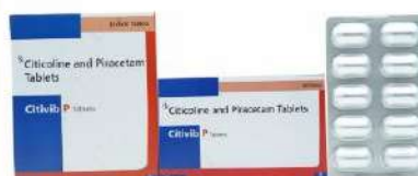
Citicoline 500mg + Piracetam 800mg