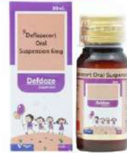
Deflazacort 6mg Suspension