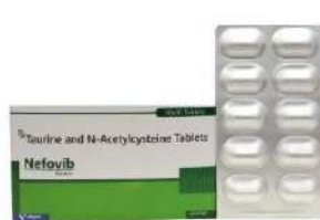
Taurine 500mg + N-Acetylcysteine 150mg