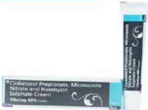
Clotbetasol 0.05% + Miconazole 2% + Neomycin 0.5% Cream