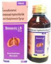
Ambroxol 30mg + Levosalbutamol 1mg + Guaiphenesin 50mg Syrup