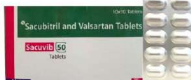
Sacubitril And Valsartan Sodium 50mg (24+26mg)