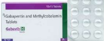
Gabapentin 300mg + Methylcobalamin 500mcg