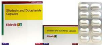
Silodosin 8mg + Dutasteride 0.5mg