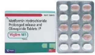
Glimperide 1mg + Metformin (SR) 500mg