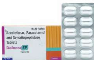
Aceclofenac 100mg + Paracetamol 325mg + Serratiopeptidase 15mg (Eq to 30,000 Enzymatic Units)