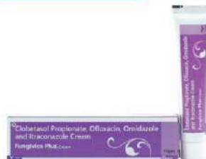
Clotbetasol 0.05% + Ofloxacin 0.75% + Ornidazole 2% + Itraconazole 1% Cream