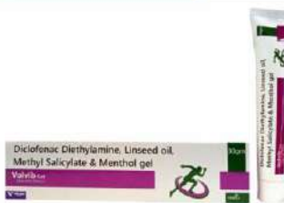
Diclofenac Sodium 1% + Linseed Oil 3% + Methyl Salicylate 10% + Menthol 5% + Benzyl Alcohol 1% Gel