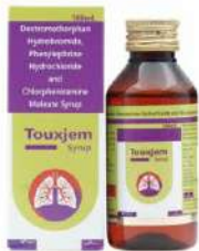
Dextromethorphan 10mg + Phenylephrine 5mg + Chlorpheniramine 2mg Syrup