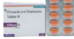
Ofloxacin 200mg + Ornidazole 500mg