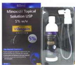
Minoxidil 5% Topical Solution