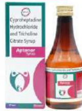
Cyproheptadine 2mg + Tricholine Citrate 275mg Syrup