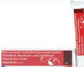
Ketoconazole 2% + Iodochlorhydroxyquinoline 1% + Tolnafate 1% + Neomycin 0.1% + Clotbetasol 0.05% Cream