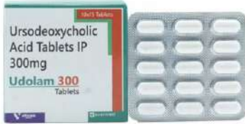
Ursodeoxycholic Acid 300mg