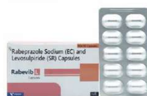
Rabeprazole 20mg + Levosulpiride (SR) 75mg