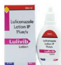
Luliconazole 1% Lotion