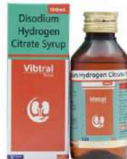
Disodium Hydrogen Citrate 1.4gm Syrup