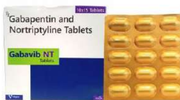
Gabapentin 400mg + Nortriptyline 10mg