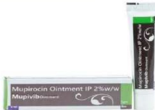
Mupirocin 2% Cream