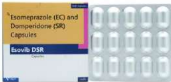
Esomeprazole 40mg + Domperidone (SR) 30mg