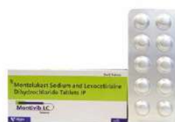
Montelukast Sodium 10mg + Levocetirizine Dihydrochloride 5mg Tablets