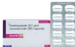
Esomeprazole 40mg + Levosulpiride (SR) 75mg