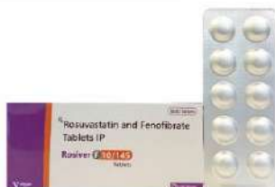
Rosuvastatin 10mg + Fenofibrate 145mg