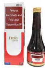
Ferrous Ascorbate 30mg + Folic Acid 500mcg Suspension