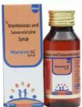
Levocetirizine 2.5mg + Montelukast 4mg Syrup