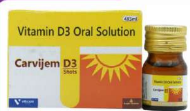
Vitamin D3 60,000 IU Shots