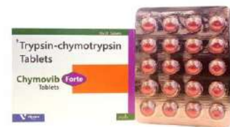
Trypsin Chymotrypsin 100000 A.U.