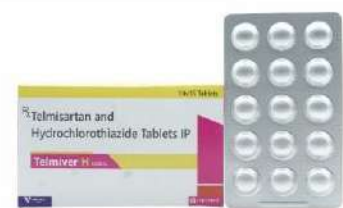
Telmisartan 40mg + Hydrochlorothiazide 12.5mg