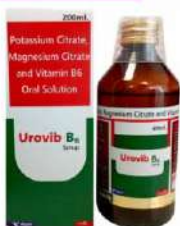
Potassium Citrate 1100mg + Magnesium Citrate 375mg + Vitamin B6 20mg Oral Solution