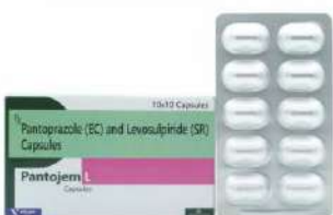
Pantoprazole 40mg + Levosulpiride (SR) 75mg