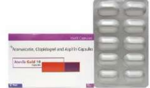
Atorvastatin 10mg + Aspirin 75mg + Clopidogrel 75mg