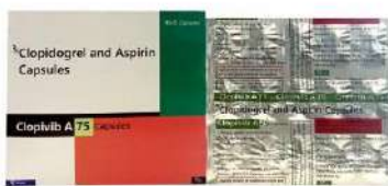
Clopidogrel 75mg + Aspirin 75mg