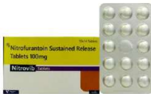
Nitrofurantoin (SR) 100mg