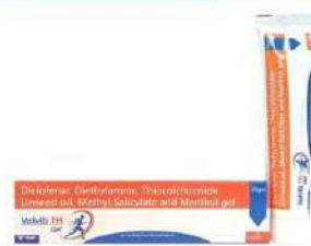
Diclofenac 1% + Thiocolchicoside 0.125% + Linseed Oil 3% + Methyl Salicylate 10% + Menthol 5% + Benzyl Alcohol 1% Gel