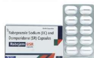
Rabeprazole 20mg + Domperidone (SR) 30mg