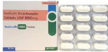
Sodium Bicarbonate 1000mg