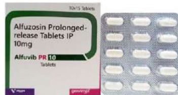
Alfuzosin (PR) 10mg