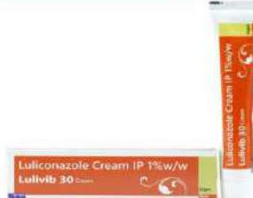
Luliconazole 1% Cream