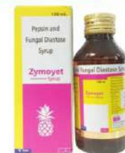
Pepsin (1:3000) 10mg + Fungal Diastase (1:1200) 50mg Syrup