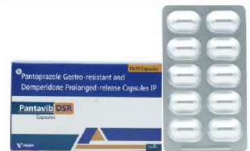
Pantoprazole 40mg + Domperidone (SR) 30mg