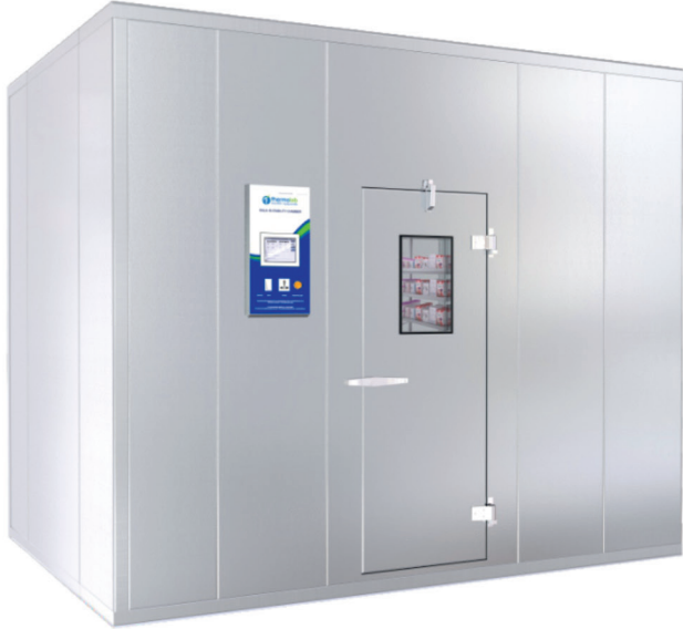
Walk in Stability Chamber | Walk in BOD Incubator Walk in Cooling Cabinet | Walk in Deep Freezer