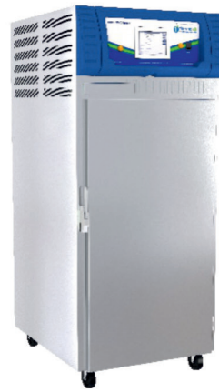
Cooling Cabinet (2°C To 8°C)