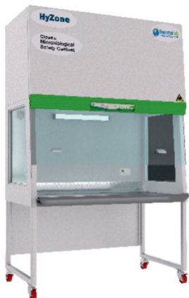
Microbiological Safety Cabinet & Laminar Air Flow