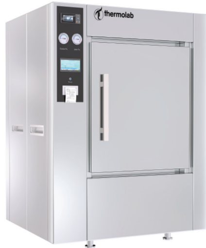
Horizontal Sterilizer Double Door