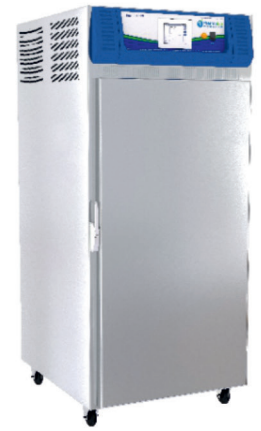
Deep Freezer (-20°C, -40°C, -60°C, -86°C)