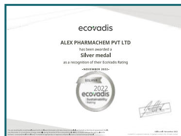
Ecovadis Rating Certificate