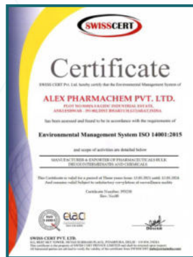
ISO 14001:2015 Certificate