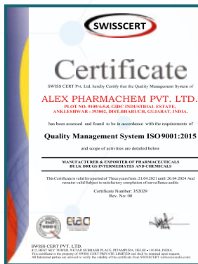
ISO 9001:2015 Certificate