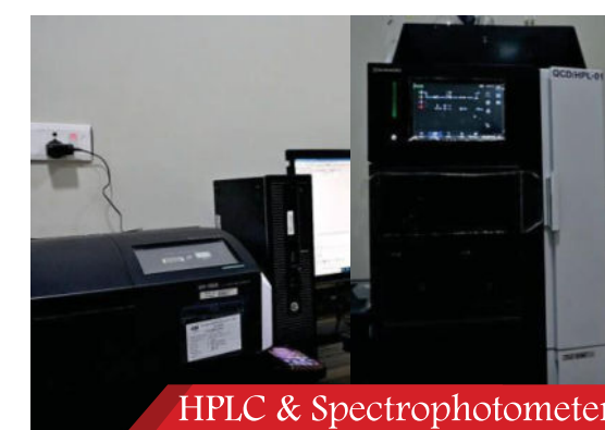
HPLC & Spectrophotometer

The company has not left any stone unturned incorporating major quality control instruments like the HPLC, Dissolution Apparatus, Autotitrator, Spectrophotometer, incubators, I.R. and stability chambers of various capacities.