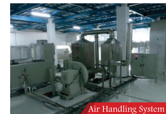
Air Handling System

The air handling system in the facility features multiple filtration levels that prevent all kinds of even minute contaminations. The purified water system also banks on various processes like Chlorination, carbon filtration, dichlorination, cartridge filtration, reverse osmosis, electro-dionization and ultraviolet rays. Our processes aim to utilize water resources at their optimal levels while our effluent treatment plant ensures proper treatment of effluents and waste pertaining to production.