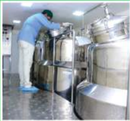
Liquid Orals Manufacturing