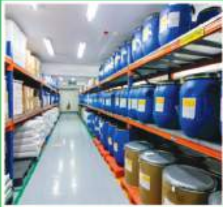
R. M. Store Area