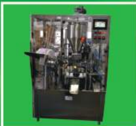
Lami and Plastic Tube Filling and Sealing machine