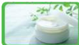
External Preparation (Cream, Ointment, Oil, Lotion, Liniment, Roll on)