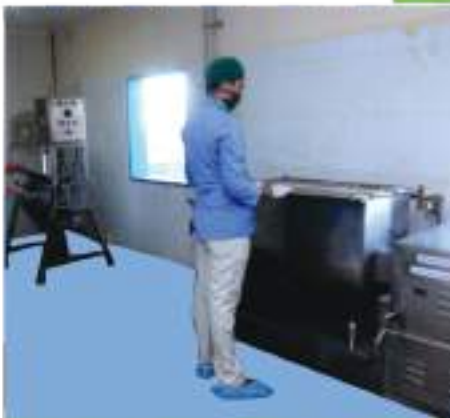
Manufacturing of Bulk / Granulation