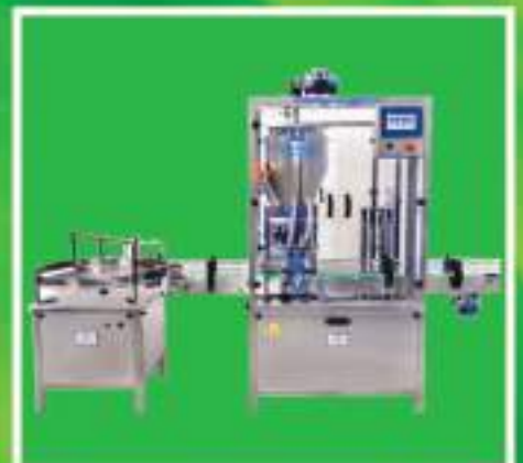
Oil, Balm, Gel Filling machine