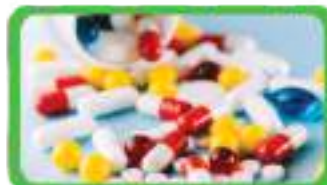
Oral Solids (Tablet and Capsule)

(0.5 million Hard Gelatin Capsule / 8 Hrs.) (1 Million Tablets / 8 Hrs.)