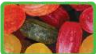
Lozenges, hard Candies, Sugar Candies