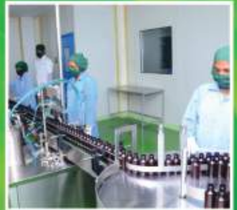
Filling & Sealing