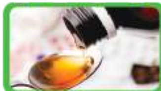
Oral liquid (Syrup, Suspension, Drop, Oral Spray)