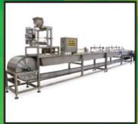
Batch Mass Cooling Belt