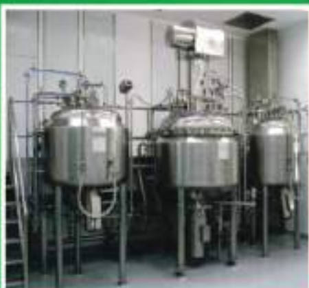
Oil and Semi-Solid Formulation Mfg Unit