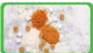
For oral use Granulations / Powder / Churna

(0.5 million Hard Gelatin Capsule / 8 Hrs.) (1 Million Tablets / 8 Hrs.)