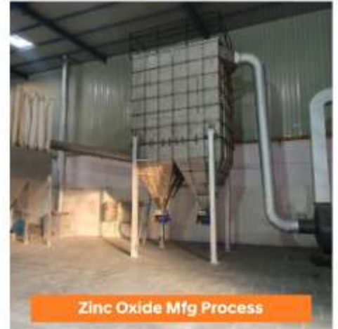
Zinc Oxide Mfg Process