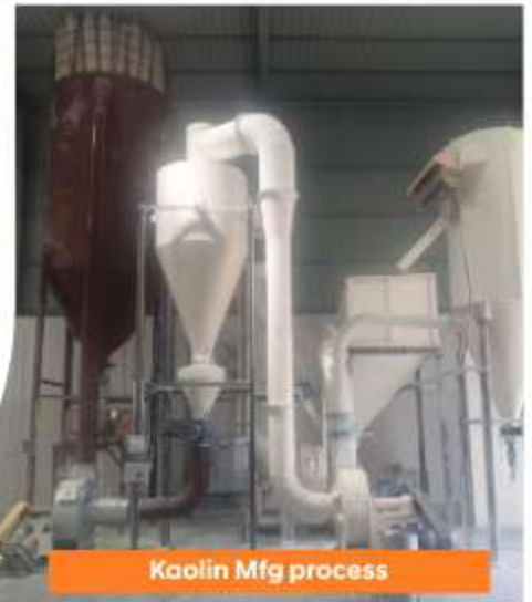
Kaolin Mfg process