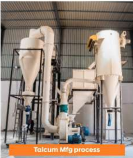
Talcum Mfg process