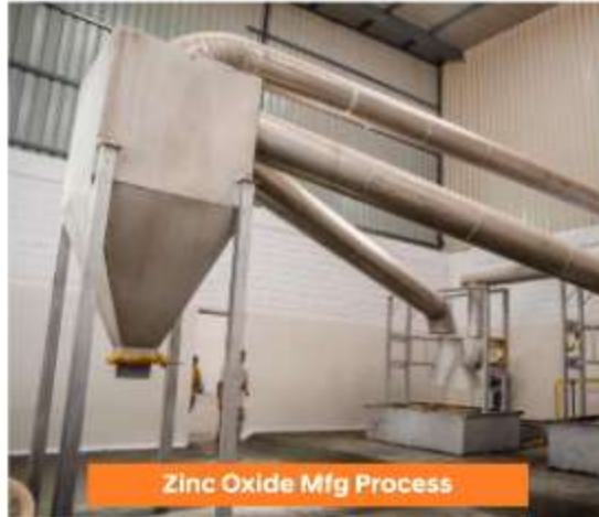
Zinc Oxide Mfg Process