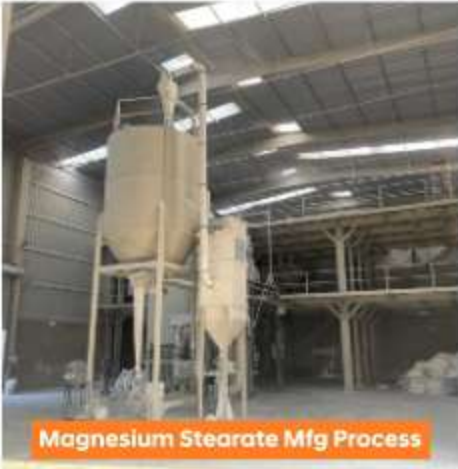
Magnesium Stearate Mfg Process