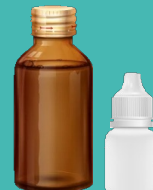
Bottles & Drops