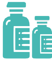
Syrup & Suspensions