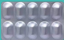
Blister, Alu Alu and Strip