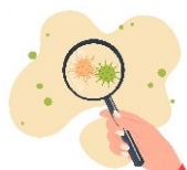
Corticosteroid and Antifungal cream