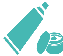
Externals (Gels, Lotion, Cream etc)