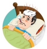
Analgesic and Antipyretic