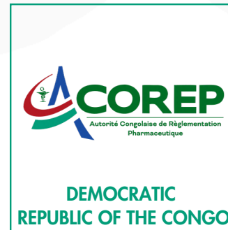
DEMOCRATIC REPUBLIC OF THE CONGO