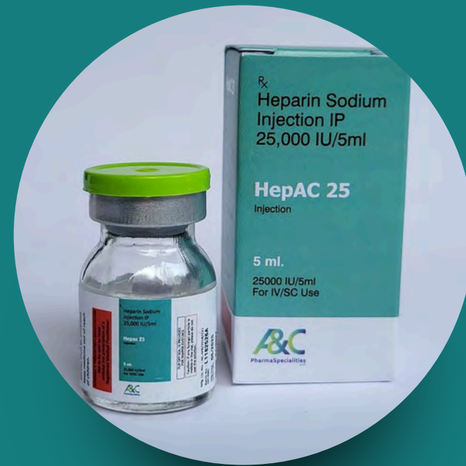
Heparin Sodium Injection IP 25000 IU / 5000 IU