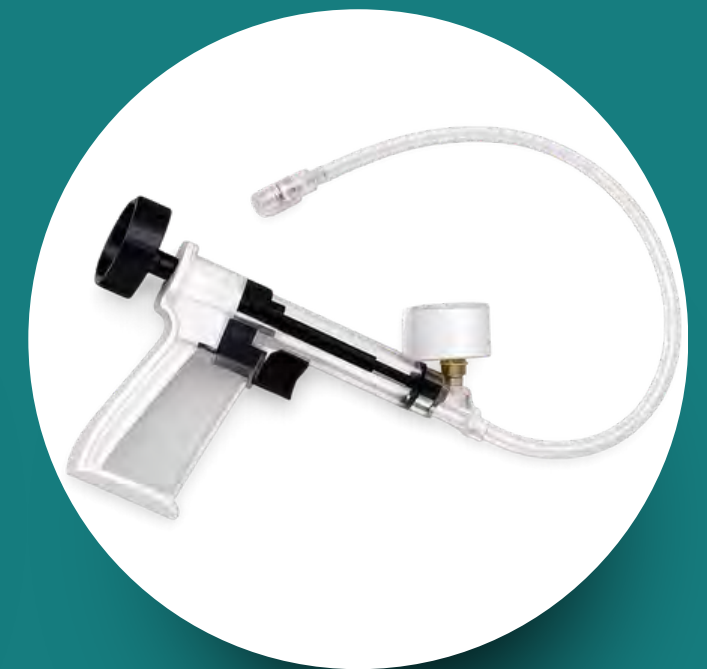
InflAC Inflation Device Gun