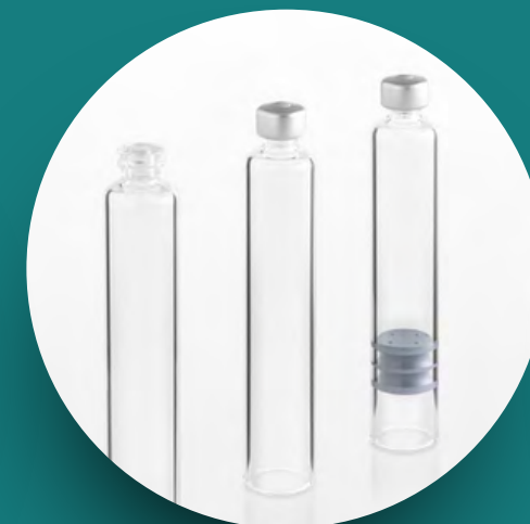
Siliconised, Sterilised Cartridges / Non Sterilised Cartridges