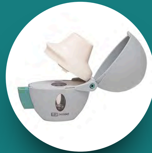
Dry Powder Inhalers