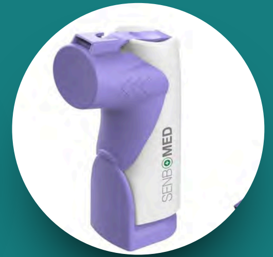
Metered Dose Inhalers