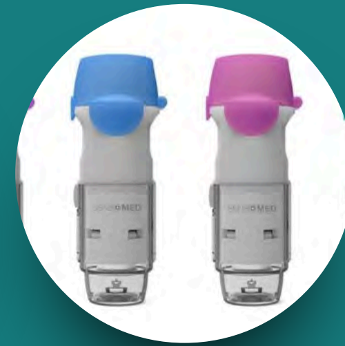
Soft Mist Inhalers