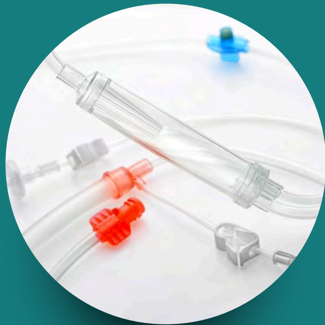
TubAC Blood Tubing Set