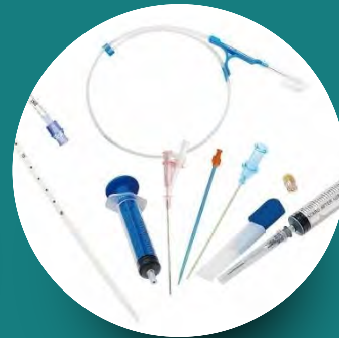
CathAC HD Catheter Kit