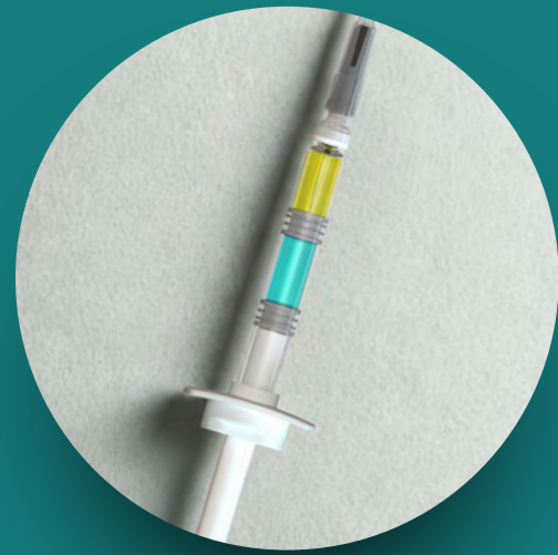
Dual Chamber Syringes