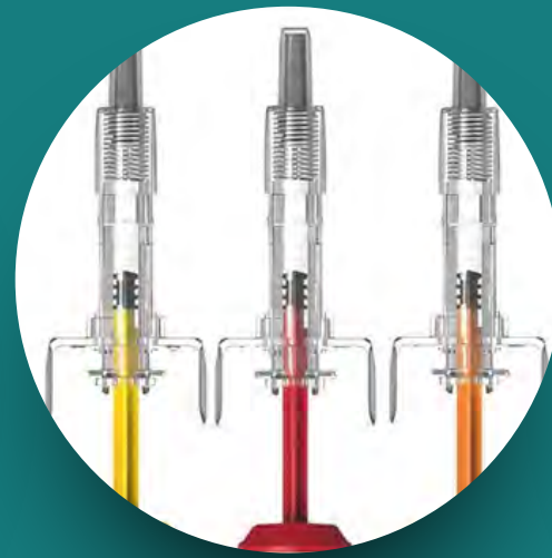
PFS Safety Devices