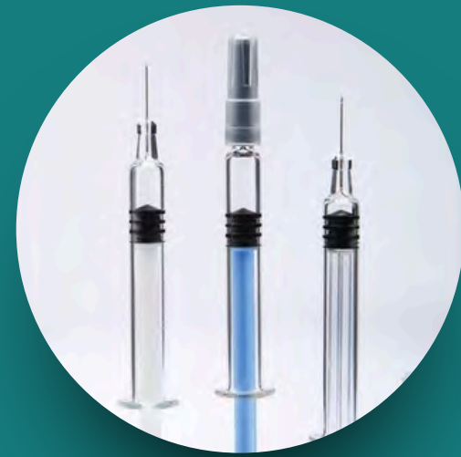
Single Chamber Syringes