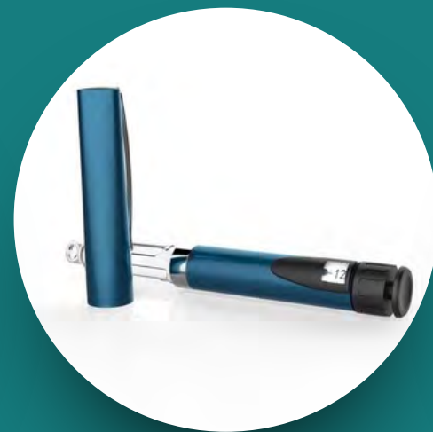
Disposable & Reusable Pens